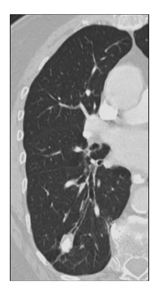
Figure 2 A 58-year-old male patient, 5 years of disease-free survival after melanoma of the left limb, now presenting with a solitary lesion of the right lower lobe. Multi-detector row CT, coronal reformation.

Apart from malignant disease, the differential diagnosis of single or multiple pulmonary nodules in patients with known malignancies should include pulmonary nodules of benign origin. The list of differential diagnosis for benign nodules is long and includes granuloma, sterilised metastases, infection (such as invasive aspergillus and candidiasis), and the proliferation of intrapulmonary lymph nodes. If a reasonable possibility exists that a new nodule may represent benign disease, histopathological proof can definitely influence patient management. Here, interventional percutaneous localisation techniques may be helpful in the preoperative marking of a lesion.